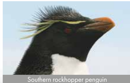
Southern rockhopper penguin